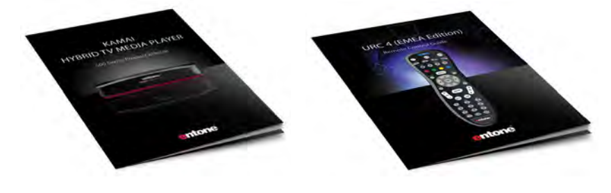
Kamai Product Manual